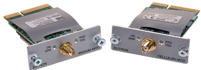
CELLULAR-MOD-5 and IRIDIUM-MOD card