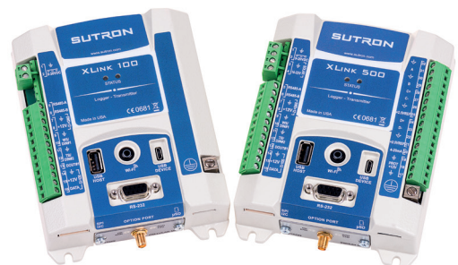
XLink 100 and XLink 500